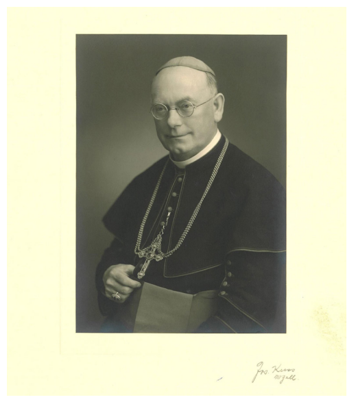
Fig. 5. The Bishop of Rožňava Michal Bubnič with the pax.