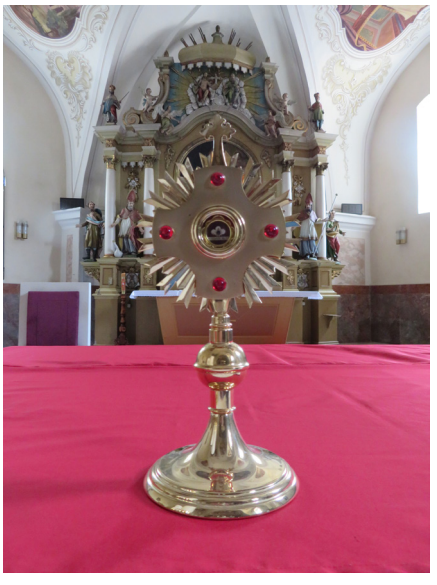
Fig. 6. Reliquary of St. Constantine-Cyril in the Church of St. Stephen the King in Bzovík.