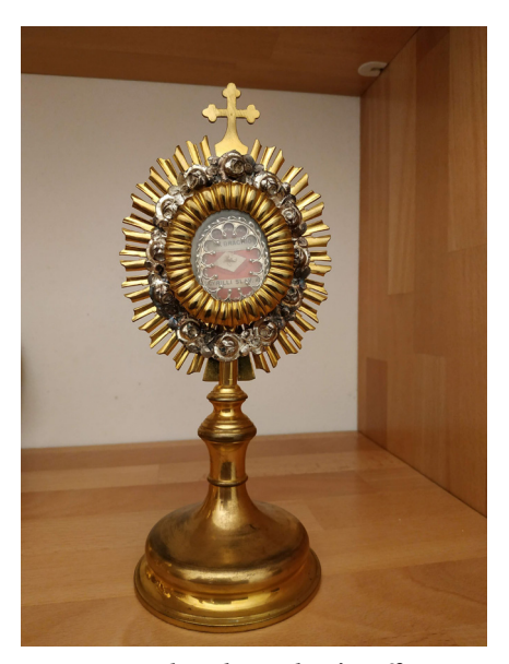
Fig. 4. Reliquary of St. Constantine-Cyril at the Bishop's Office in Banská Bystrica.