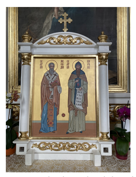
Fig. 10. Reliquary of St. Constantine-Cyril in the Greek Catholic Cathedral of the Nativity of the Blessed Virgin Mary in Košice.