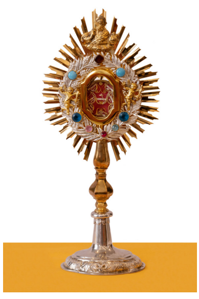
Fig. 1. Reliquary of St. Constantine-Cyril in the Church of St. Ladislaus in Rajec.