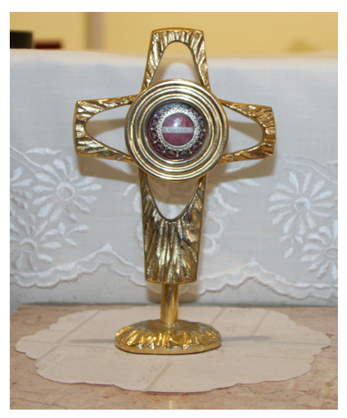
Fig. 9. Reliquary of St. Constantine-Cyril in the Church of Sts. Cyril and Methodius in Selce.