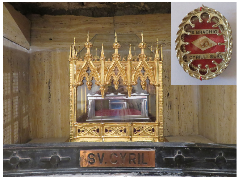
Fig. 2. Reliquary of St. Constantine-Cyril in St. Emmeram's Cathedral in Nitra.