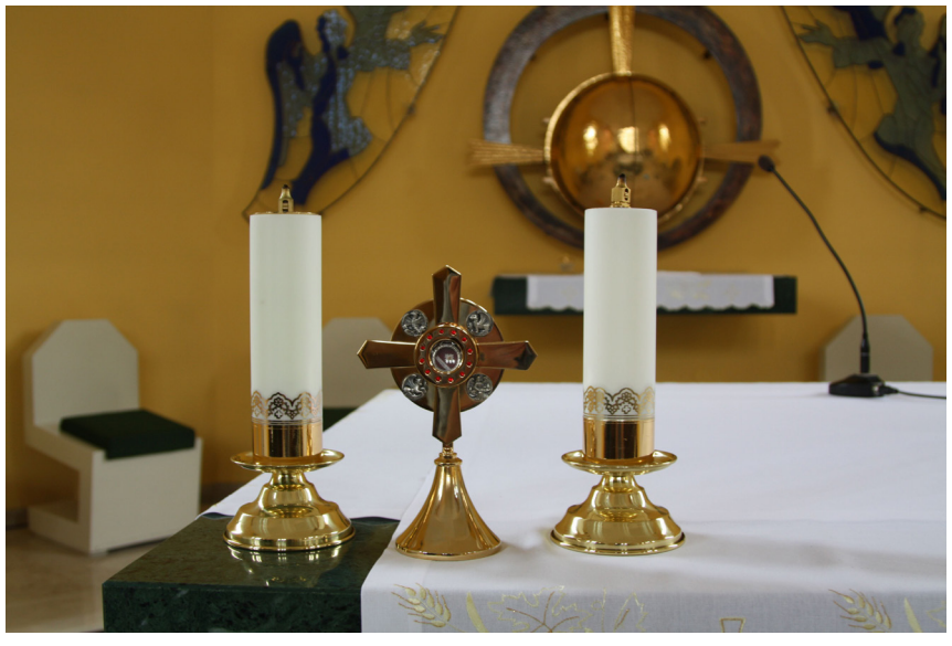
Fig. 8. Reliquary of St. Constantine-Cyril in the Church of Sts. Cyril and Methodius in Rakovice.