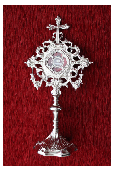
Fig. 7. Reliquary of St. Constantine-Cyril at the Bishop's Office in Žilina.