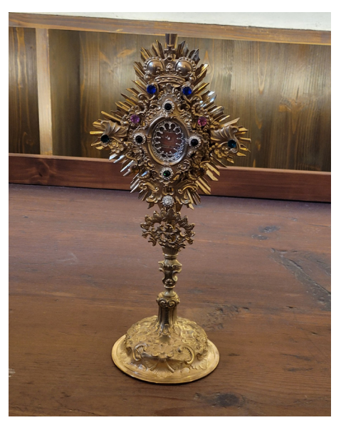
Fig. 3. Reliquary of St. Constantine-Cyril in St. Martin's Cathedral in the Spiš Chapter.